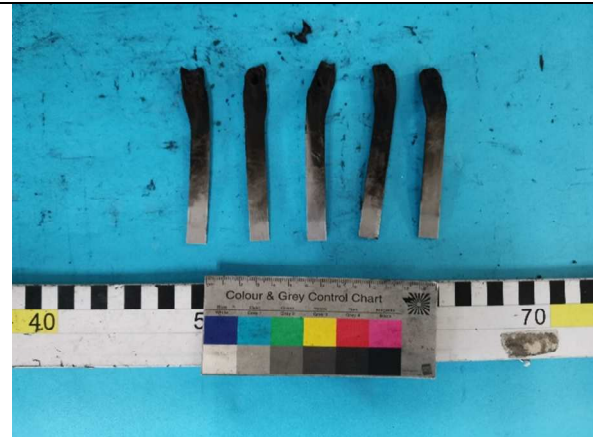
After test-As received