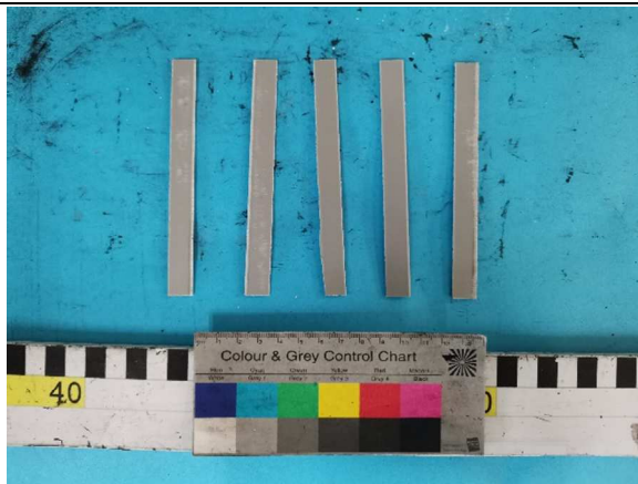
Before test-As received